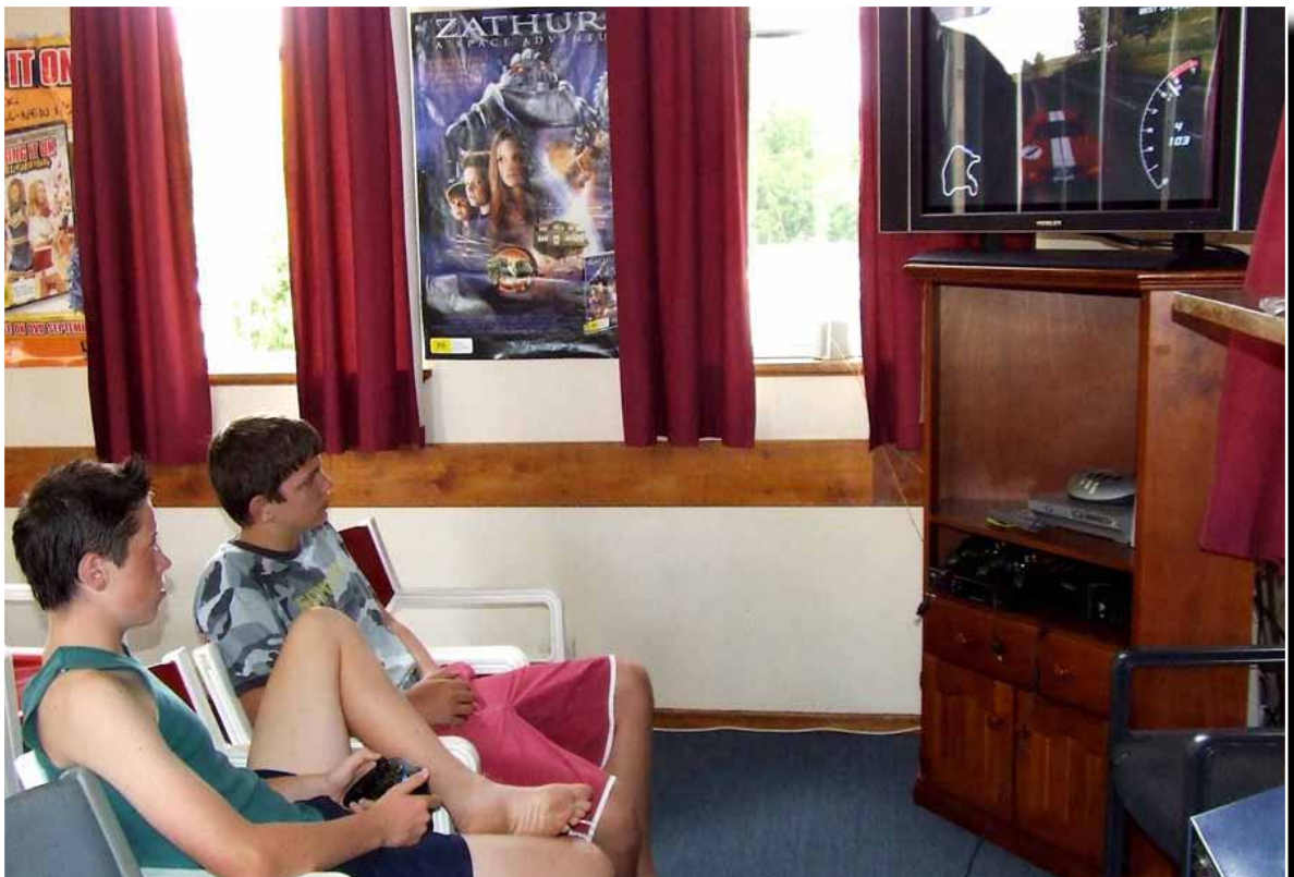
All the boarding Houses are comfortable and warm with a 'home away from home' atmosphere

We would also encourage your son to consider joining the Chapel Choir.