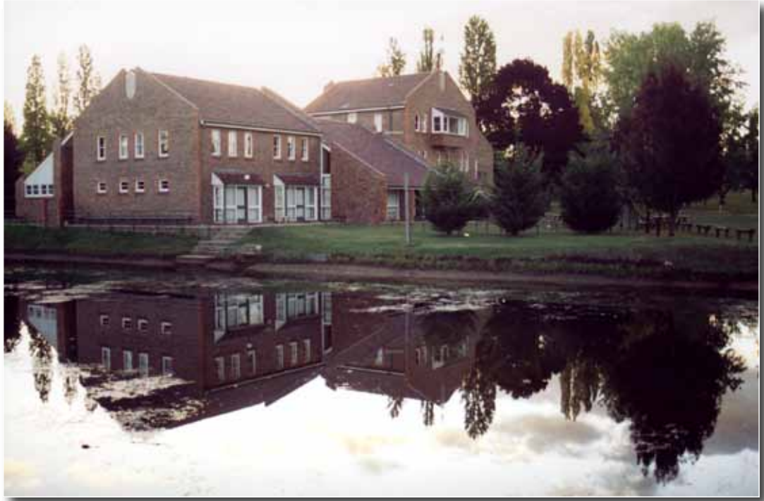
Croft House, is one of the Boarding Houses at TAS