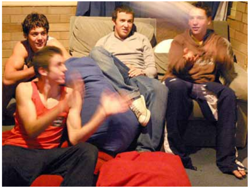
Senior boys enjoy 'time out' in one of the Boarding House common room

Inter-House competition, House sports, camping weekends and House social activities such as dinners all help to build House spirit and identity.