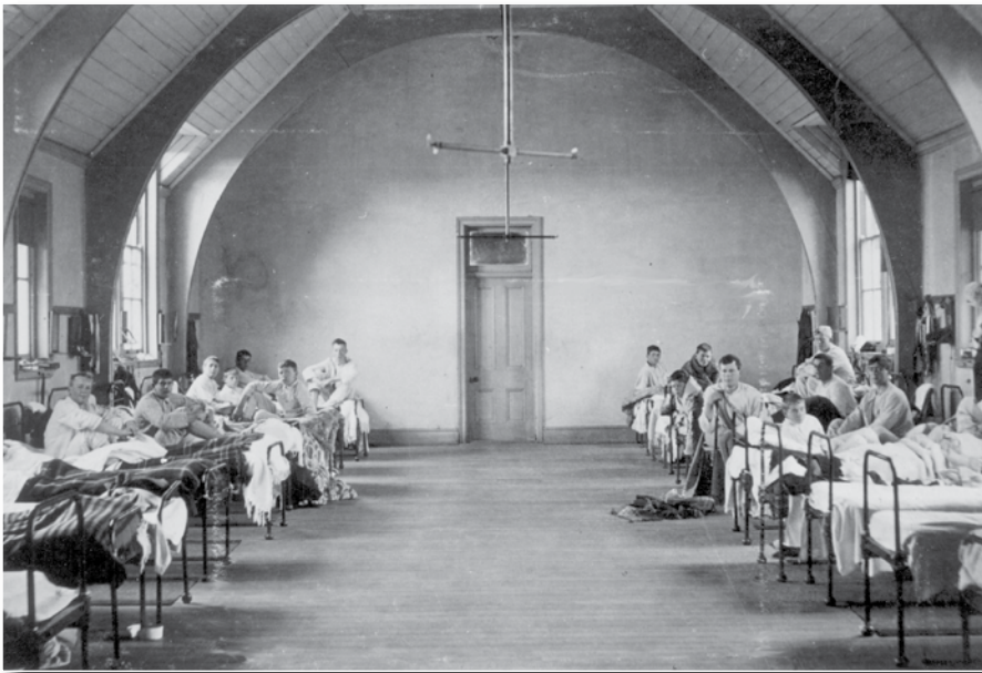
Boys in the top dormitory c 1898 - times have certainly changed

The succeeding decades have seen significant changes in boarding styles and facilities but the strong spirit developed in those early days still persists.