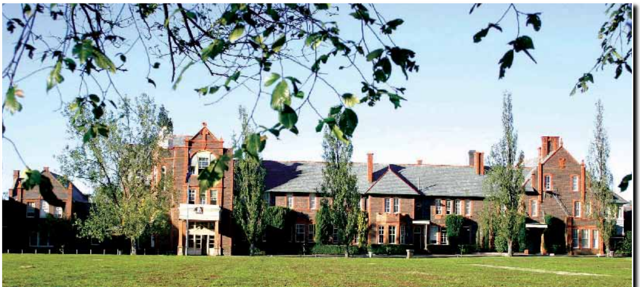
Front of The Armidale School

Through its membership of the international Round Square Conference of schools, TAS has links to schools such as Gordonstoun in Scotland, Wellington College in the United Kingdom, The Athenian School in California and the Doon School in India. This has enabled TAS to establish an international reputation and thus we are able to offer your son a world of opportunity.