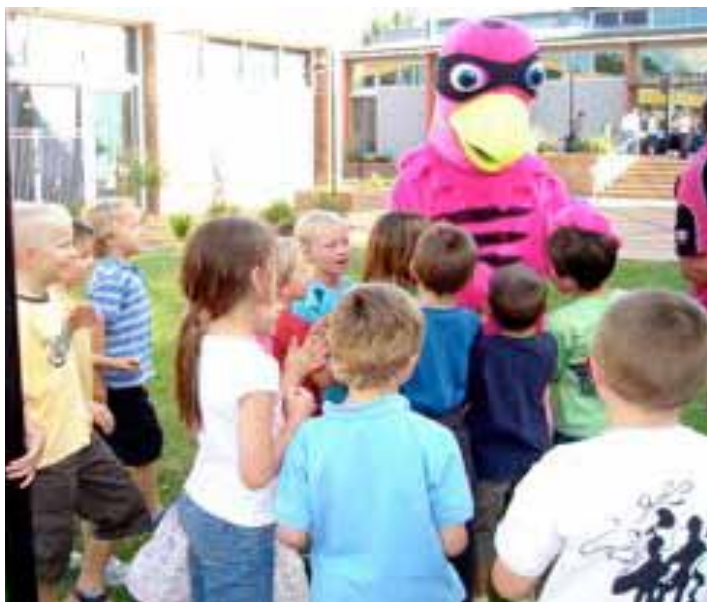
We were very excited when the Eagle flew in to deliver our pizzas!

Our parent helpers were a wonderfully supportive group who ensured the children had a really great time. I am very grateful to them for their assistance.