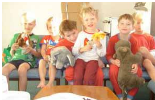
The early risers